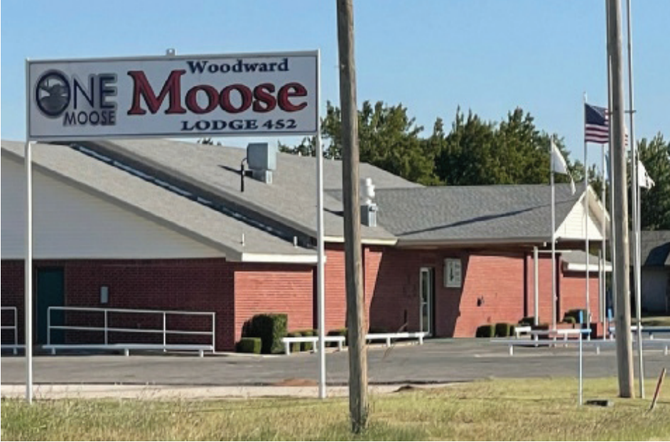
It's a new year at Woodward Moose Lodge 452

The Moose is an international organization of men and women dedicated to caring for young and old, bringing communities together, and celebrating life.