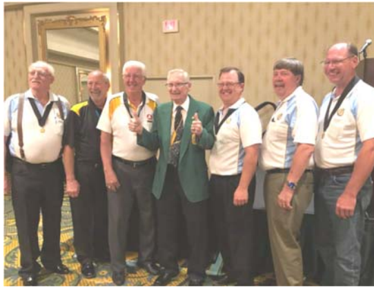
2018-2019 Champion Ritual Team, Grumpy approved