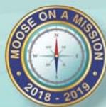
Lodge & Chapter Pin

Moose On A Mission lapel pins are presented by your Lodge, Chapter or Moose Legion to members that sponsor their first member during this campaign.