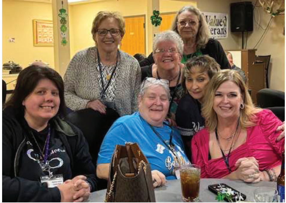
FROM OSKMA MID YEAR CONFERENCE