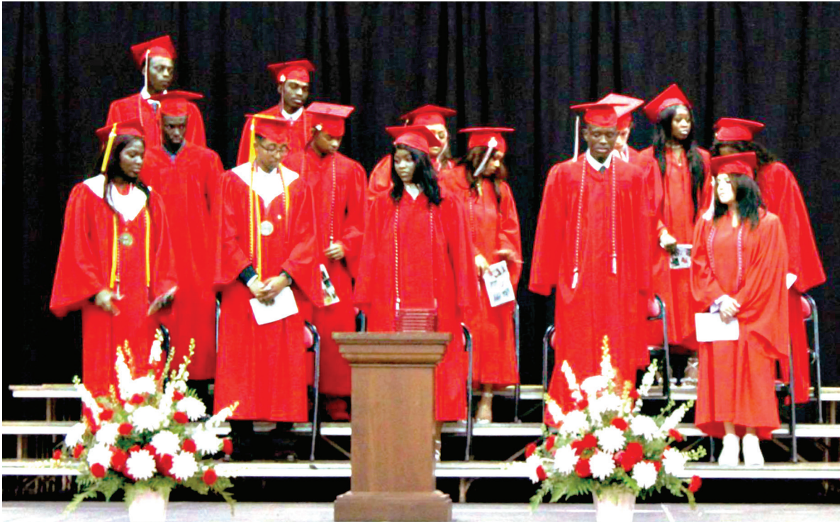
Fourteen Mooseheart High School seniors, "our kids," received their diploma's on June 3, 2023. All of them received a scholarship and will be attending college or trade school this fall. We want to congratulate them and wish them all the best in their future endeavors.